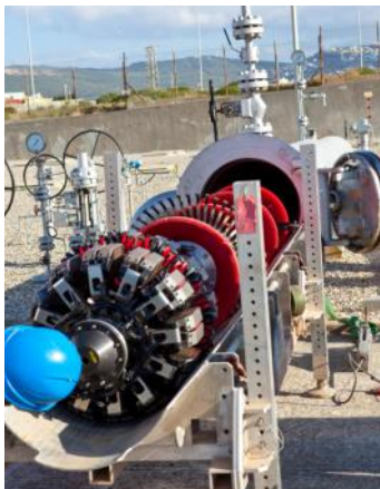
In-line inspection tool commonly known as a smart pig

Pipeline inspection is an important part of pipeline integrity management programs. Pipelines are carefully monitored and inspected through a wide array of safety measures and tools, spanning from walking the pipeline to very sophisticated technologies.